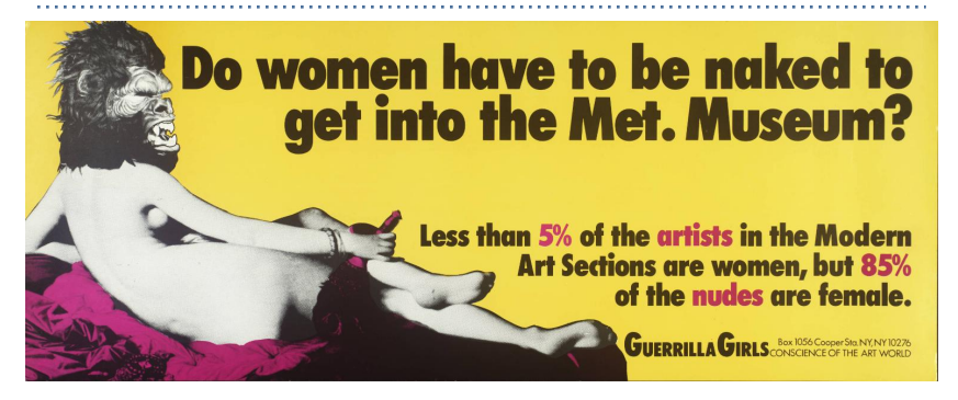
Guerrilla Girls , a feminist activist group taking on sexism and racism in the art world since 1985 https://www.guerrillagirls.com/