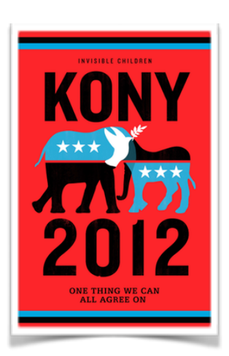
Kony 2012 poster , documentary about the child soldiers under Joseph Kony https://invisiblechildren.com/kony-2012/