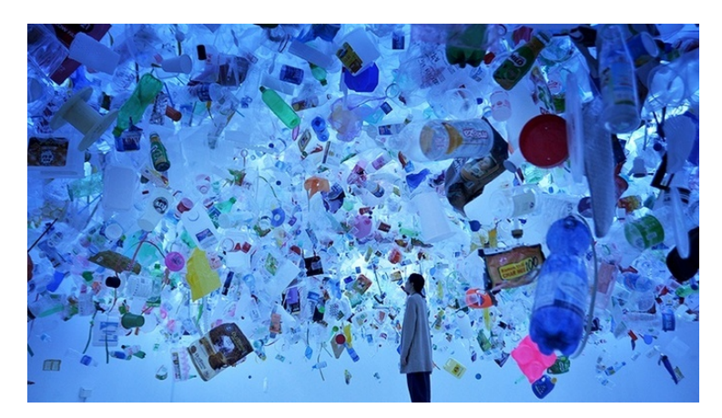
Plastic Ocean (2016), Tan Zi Xi collected 500kg of ocean plastic (~26,000 pieces) to showcase ocean pollution https://oceanic.global/tan-zi-xi/