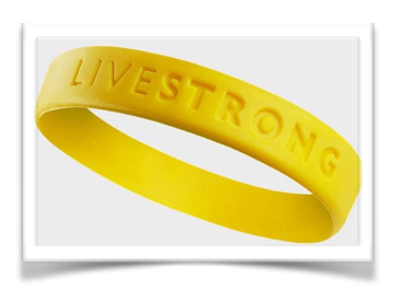
Livestrong Bracelet , cancer awareness, popularized by cyclist and cancer survivor Lance Armstrong <a href="https://www.livestrong.org/what-we-do">https://www.livestrong.org/what-we-do</a>