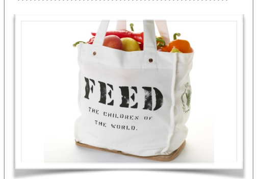
Feed Bags , which for ~$30 provided 100 meals for children in need <a href="https://wwww.feedprojects.com/">https://wwww.feedprojects.com/</a>